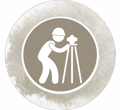
MARINE/LAND GEOPHYSICAL SURVEYS