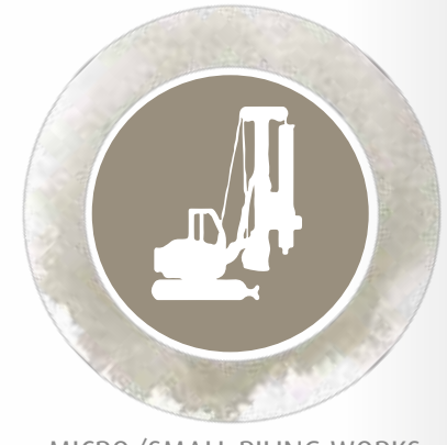
MICRO/SMALL PILING WORKS